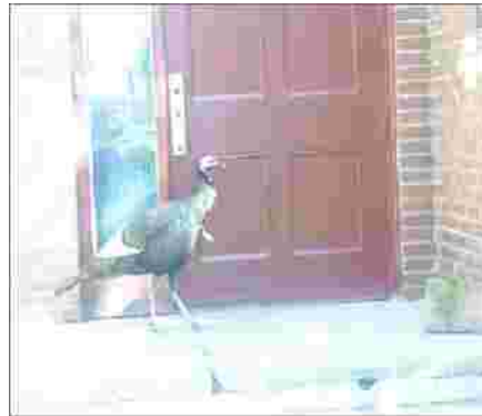
Talk about drawing the circle wide! A neighbor snapped this photo of a wild turkey trying to get into Calvary St. Andrew's. Yes, all are welcome to our table!

On Tuesday I was talking with our neighbors who come in for fresh produce and smack in the middle of the chaos, it struck me why this one particular woman lifted my heart. She reminded me of my grandmother in her smile, humor and general pleasantness. As